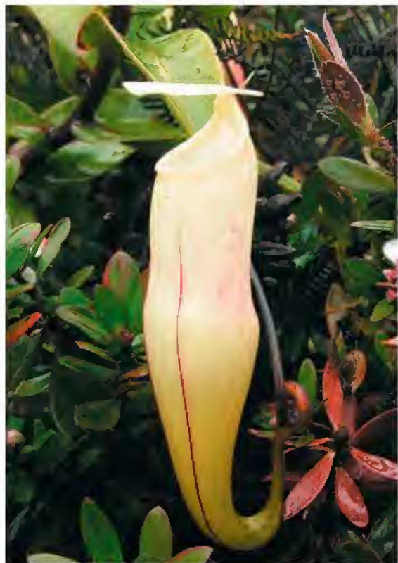
Figure 1: The pitchers of Nepenthes alba may be pure white.

Nepenthes alba is named after the Latin albus (white). The name refers to the colouration of the upper pitchers of this plant (see Figure 1 and Front Cover). Nepenthes alba is widespread across the upper slopes of Mount Tahan, in Taman Negara (Malaysia's largest national park) and it occurs with increasing abundance from 1600 m (5250 ft) altitude to the summit of the mountain, which stands at 2187 m (7175 ft). The population of N. alba on Mount Tahan consists of many tens of thousands of plants which display consistent morphology, size, and general colouration (although the upper pitchers vary in colour). The wider distribution of N. alba beyond Mount Tahan remains unclear but herbarium specimens from Mount Tapis may represent